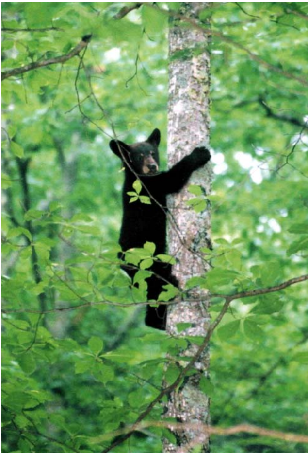
Black Bear Cub on Pine Mountain

September 21, 2004 at 1 PM at the Hensley Settlement in Bell County, KY. For more info, call (606) 633-2362. Attendees must arrive by 10 AM at the Cumberland Gap Visitor's Center so that we can shuttle folks up. The shuttle will have us to the Settlement by 11 AM and we can hike around the 2 mile loop trail. Pack your own lunch and drink!