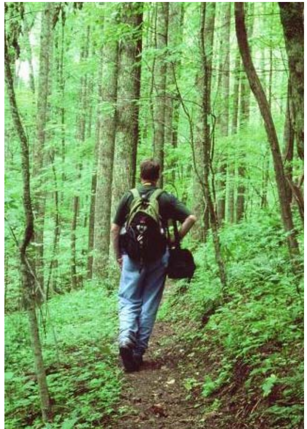
A Mid-Summer Hike near Bear Rock

These funds will help us clean, renovate and re-vegetate the trail from Mullins Pond to Bryant Gap on the Birch Knob Section. The Kentucky Department of Parks has authorized Vaughn & Melton Engineering to do property work on the ‘Wilderness Road Section’ from Cumberland Gap to Pine Mountain State Park. This should mean that, at some point in the next year or so, we will soon be building the trail to connect these two tourism hotspots. As if all this weren’t good enough, we will also be getting cleared to draw from our $100,000 in TCSP grant funds and will likely be getting Americorps Volunteers within the next nine months. Succeed!